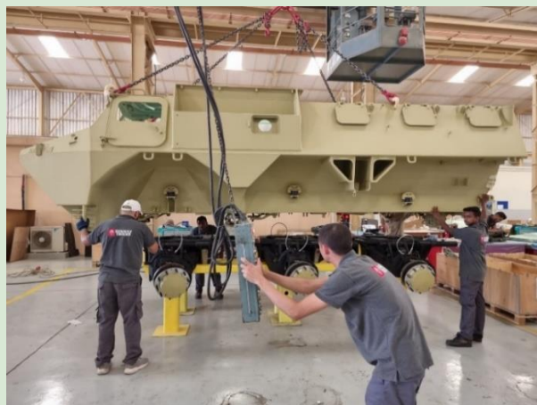
French Minister of Armed Forces visit of the VAB Workshop in Qatar

Visit Arquus at booth HALL 5A – F127! Consult the press release here